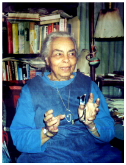
November 2002